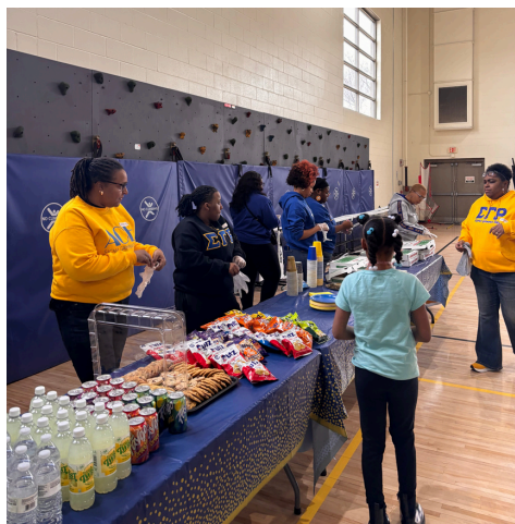
Sorors setting up refreshments for the Annual Youth Symposium at the Kingsley Association Community Center.